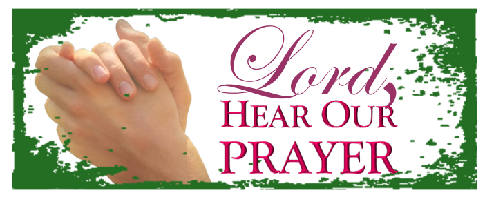
Most Current Printout Of On-Going Concerns Is